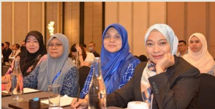
Delegates of GUT 2023.