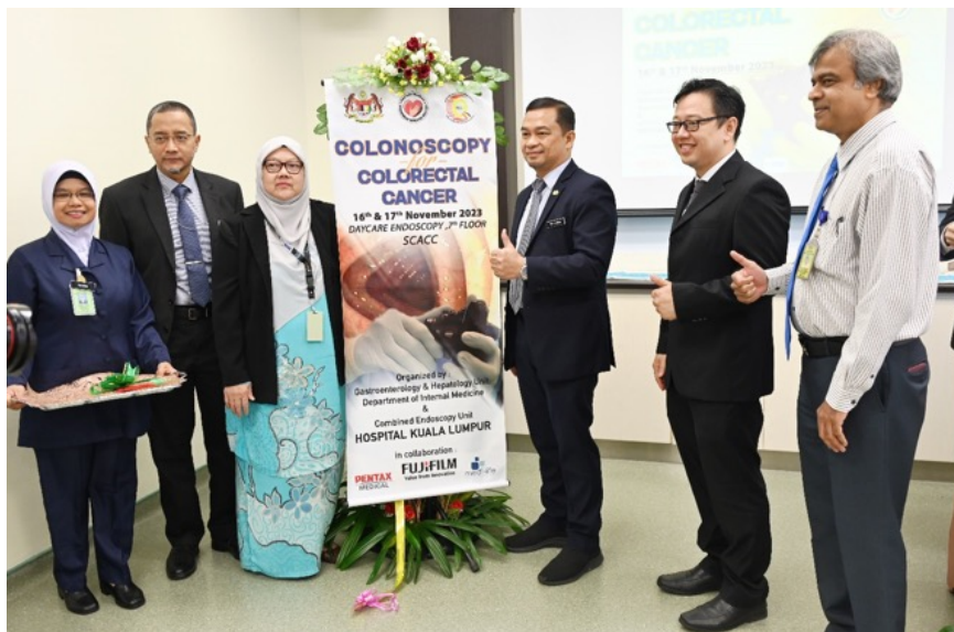
Officiating the Colonoscopy for Colorectal Cancer HKL 2023.