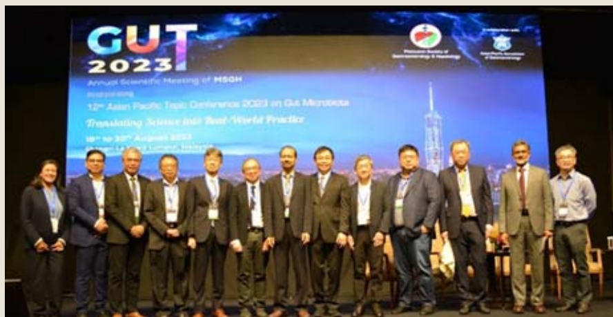
MSGH Executive Committee with the International Faculties.