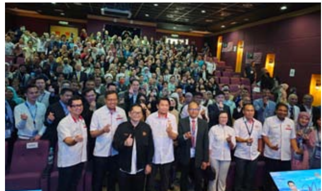
Group photo session at the Opening Ceremony.