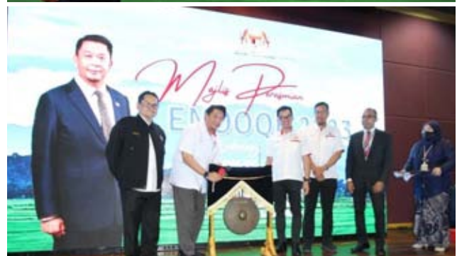
Deputy Health Minister, YB Dato’ Lukanisman bin Awang Sauni, officiating the Opening Ceremony by hitting the gong three times.