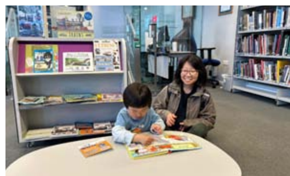
Enjoying some family time with her son at the local library.

However, within these challenges lie opportunities for personal and professional growth. The diverse patient population and the exposure to a wide array of medical cases enriches my clinical acumen and broadens my scope of practice. Additionally, the camaraderie among colleagues and support from the consultants and networks within the NHS create a sense of community and mutual support.