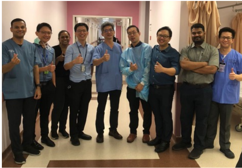
The Endoscopists and Event Organisers.