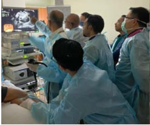
EUS and ERCP Hands-on workshop.