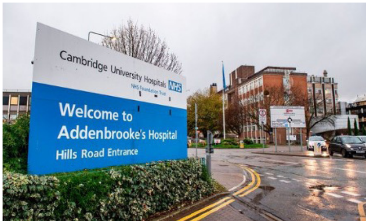
Entrance of Addenbrooke's Hospital.

After all, the NHS has been a role model for many countries as a provider of top-notch, holistic, and personalised medical care.