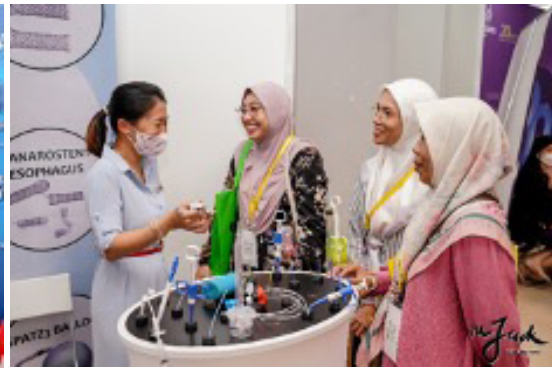
Attendees of the workshop.