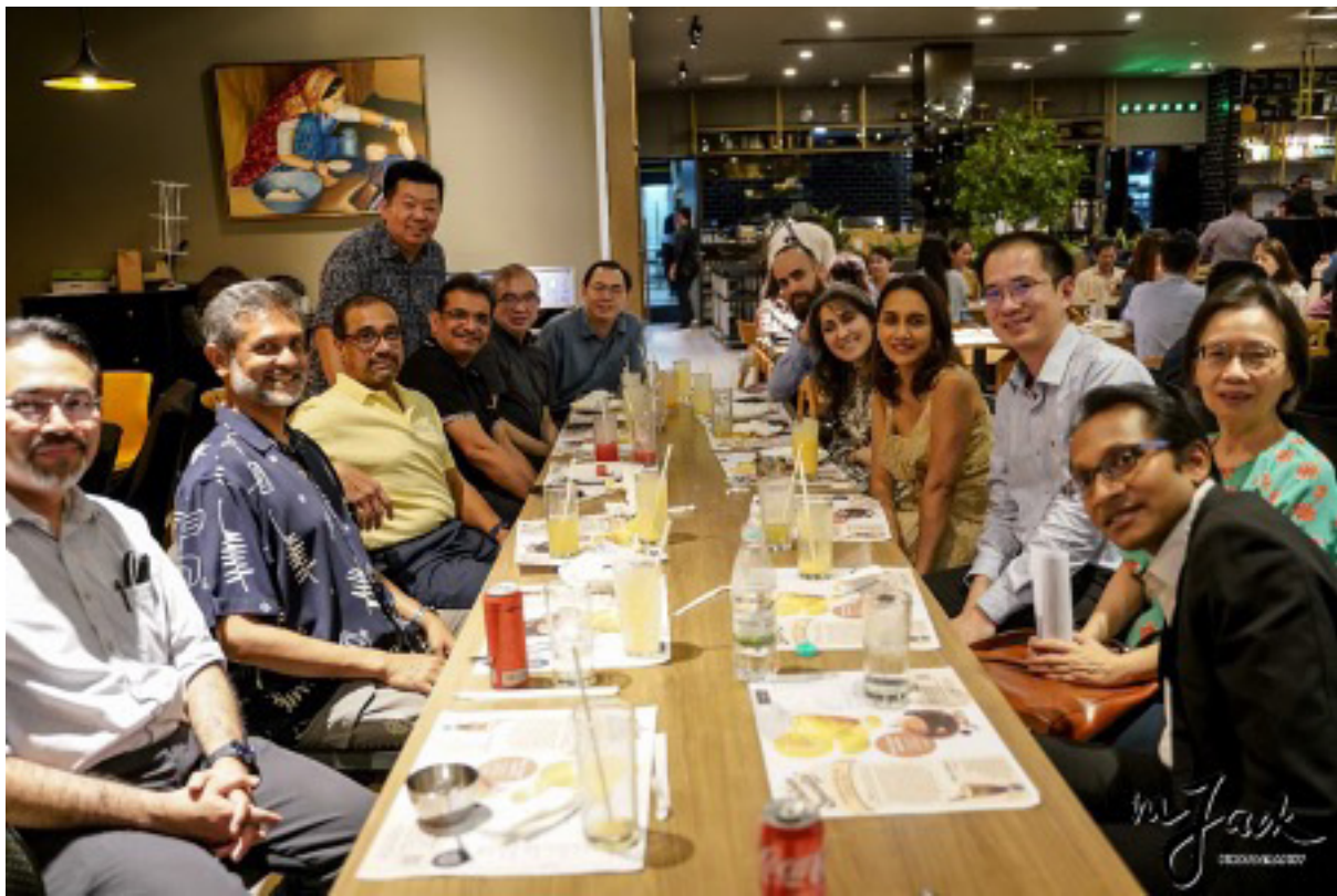
At the Faculty Dinner.