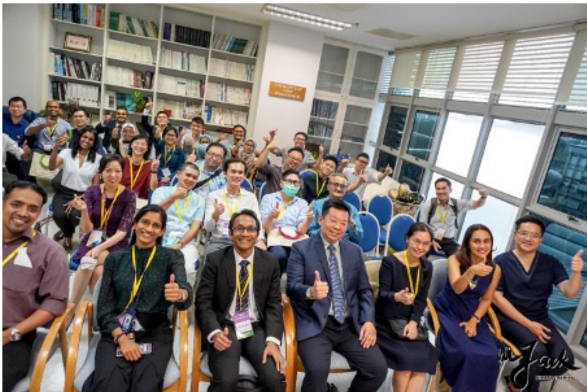
The Young Consultant Workshop.