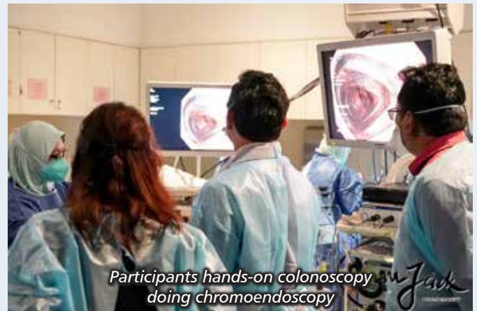
Participants hands-on colonoscopy doing chromoendoscopy