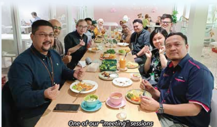
One of our "meeting" sessions