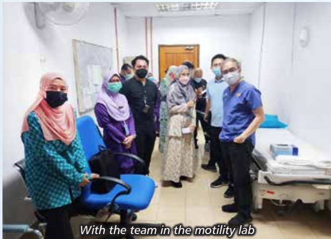
With the team in the motility lab

I was exposed to a wide array of motility tests and cases encompassing High Resolution Esophageal Manometry, High Resolution Pharyngeal Manometry, 24hour pH Impedance Studies, Wireless Capsule pH study, High Resolution Anorectal Manometry, Hydrogen and Methane breath tests, colonic transit studies, endoanal ultrasound, gastric emptying test; just to name a few.