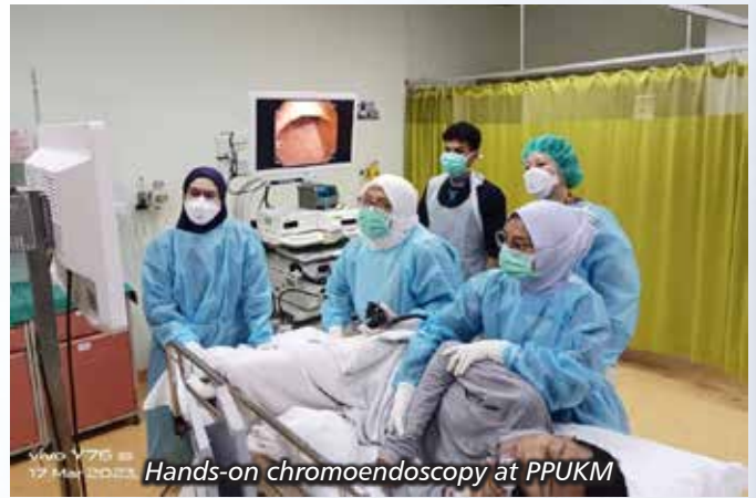
Hands-on chromoendoscopy at PPUKM