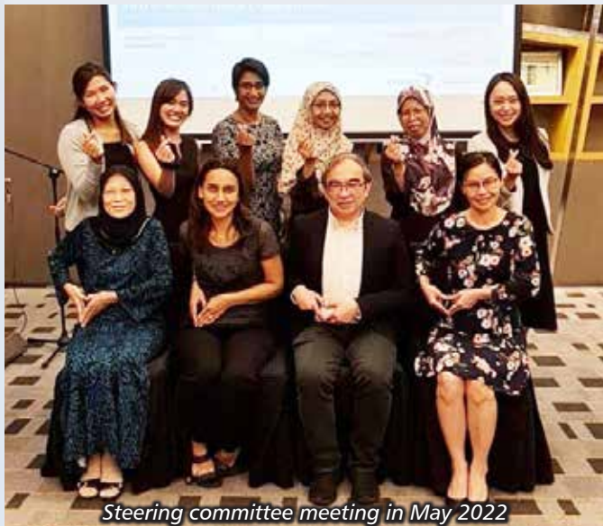
Steering committee meeting in May 2022