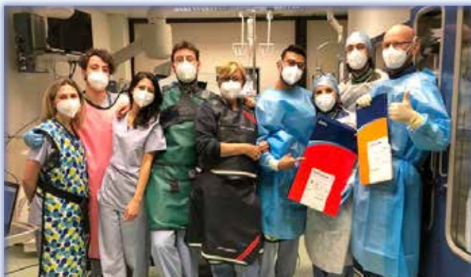
With colleagues at work

Aside from work, I have had some weekends free to explore the great cities of Italy, such as Rome and Naples, to name a few. This center is not without its challenges; however, the team's outlook and approach in the face of adversity have taught me how having the