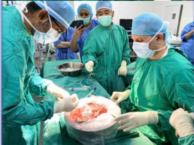
Liver transplant surgery, with Hepatobiliary Team Hospital Selayang in action

The timing of liver transplant is crucial before life-threatening complications occurs, however at the same time, finding the balance of not transplanting too early as benefits may not outweigh risk of surgery or long term complications.