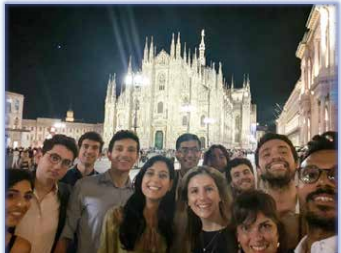
Enjoying a night out with friends at Duomo