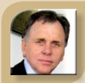
Professor Barry Marshall (Nobel Laureate 2005 and currently University of Malaya Nobel Fellow)